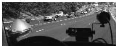
Traffic radar merely flashes a number, it does not indicate which vehicle is being clocked.

Government studies have found nine types of errors that can cause